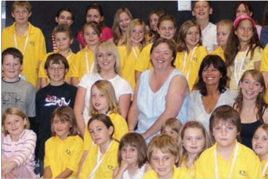
Birds of a Feather star, Pauline Quirke (pictured, centre) at the opening of the first Pauline Quirke Academy. Morton Michel is delighted to be providing the insurance cover for the academies, continuing its long history of offering flexible policies for groups, associations and clubs of this kind. For story, see page 2

The Early Years Foundation Stage (EYFS) is being introduced in September 2008 and you need to know all about it. So why not participate in an EYFS distant learning course designed by the highly regarded training company, Training Packages. You can purchase the courses on CD from our shop, taking advantage of the